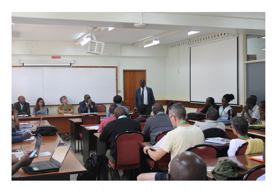
The opening ceremony of the second week