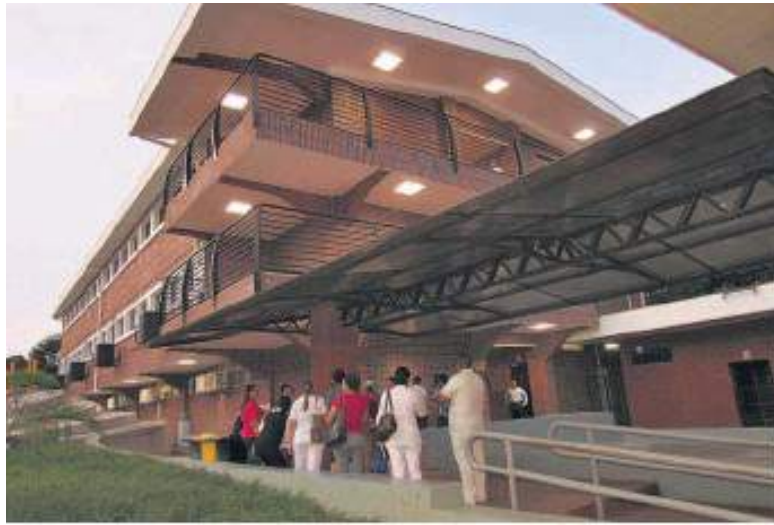
Figure 1: Gerardo Barrios building.