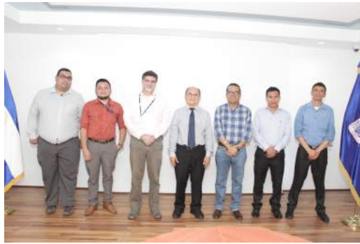
Figure 26: Meeting with authorities of UGB and the local organizing committee of EMALCA EL SALVADOR 2018.