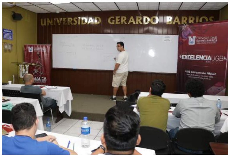
Figure 8: Course 1.