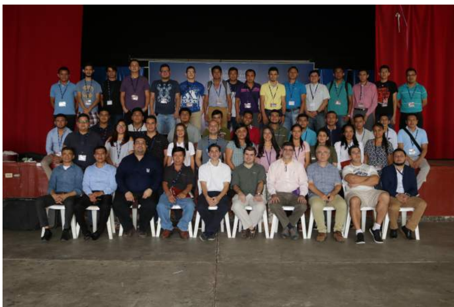
Figure 6: Participants of the EMALCA