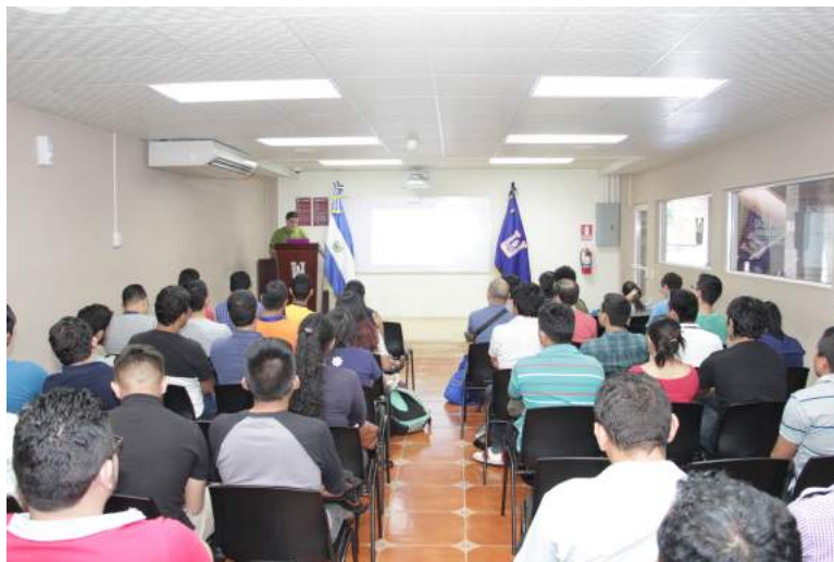
Figure 17: Conference: Mathematical models for transport phenomena.

In this talk, I will discuss about the mathematical modeling of transport phenomena related to some physical problems. We will see convection, diffusion and reaction, and their application to practical cases such as: transport of pollutants and pollution in lakes. We will see explicit and implicit discretizations. We will see discretizations of the resulting equations, concepts of consistency, stability and convergence of discretizations. Finally, there will be cases where computational simulation and how the mathematical modeling play a preponderant role in the approach and solution of real systems.