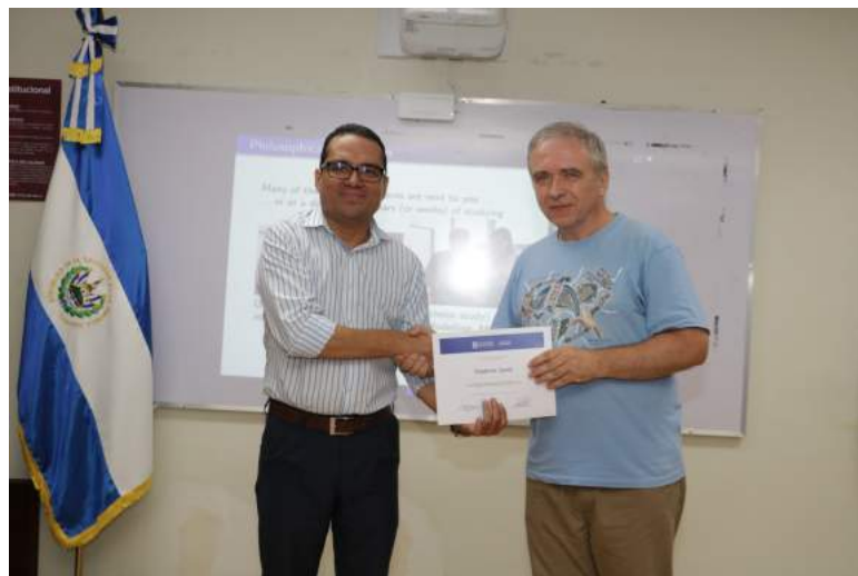
Figure 23: Conference: Metric properties of fuzzy sets.

Dissimilarities and divergences, axiomatic approach, practical examples. Role of measures of divergence in decision making. Convexity. Lattice-valued mappings, set-theoretical operations, their representation and decompositions. Triangular norms on lattices. IF-sets and interval-valued sets. Fuzzy measures and non-additive integrals. Fuzzy subgroups, subrings and ideals. Introduction to fuzzy topology.