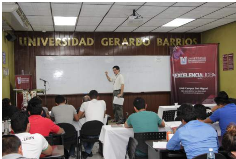
Figure 12: View of the course