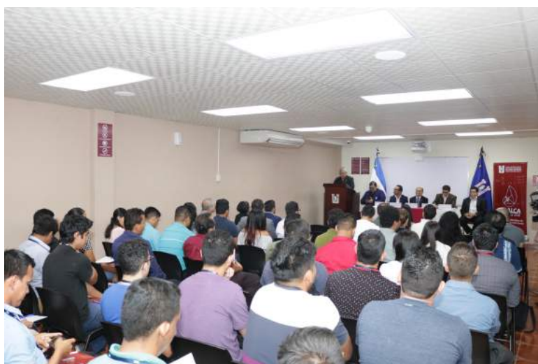
Figure 3: Inauguration talk.