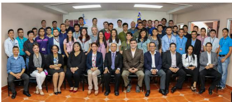
Figure 5: Participants with authorities.