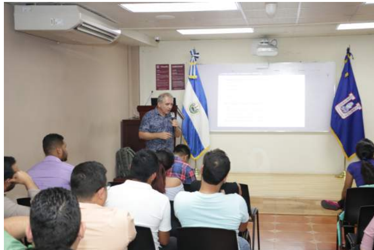
Figure 21: Conference: Approximate reasoning.

Linguistic variables. Fuzzy relations, basic operations, compositions, equivalence, closure, tolerance relation, negative transitivity, Ferrer's property. Information retrieval. Decision analysis Rule bases, if-then rules, inference rules. Mamdani and Tagaki-Sugeno regulators. Pattern recognition, the rule of maximum membership degree, the rule of threshold. Industrial applications. Construction of simple fuzzy regulators. Principles of fuzzy control.