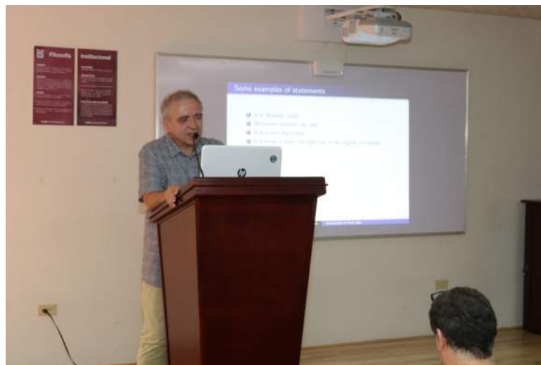
Figure 15: Conference: Introduction to fuzzy logic.

Classical and many-valued logic. Fuzzy sets, fuzzy subsets of the real line. Set-theoretical operations. Connectives in fuzzy logic, negation, conjunctions, disjunctions, implications. Triangular norms and conorms, Archimedean property, nilpotency, additive and multiplicative generators of triangular norms. Frank t-norms. Extension principle, its application in arithmetical operations with fuzzy numbers. Equivalence relations and partitions.