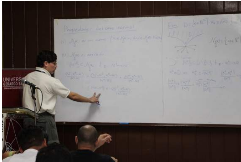
Figure 11: Course 2