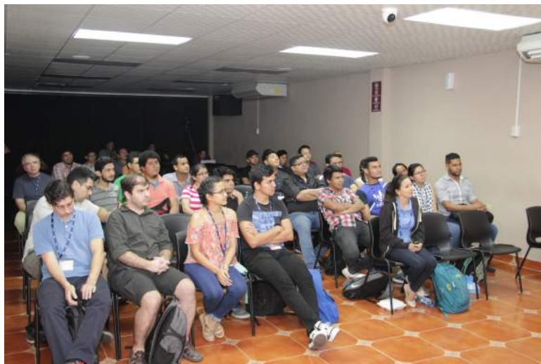
Figure 19: Conference: Mathematical Models for Topology 1D.

In this talk I will present advances in the computational simulation and mathematical modeling of the topology of circular plasmids. We will discuss about topological invariants and the modeling using the worm chain model. In addition, I will discuss about replication intermediaries and how the topological invariants are considered in this context. Finally, some simulations are going to be shown.