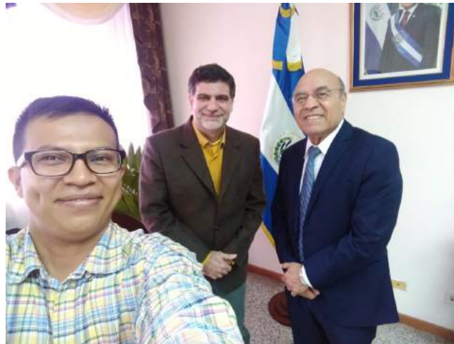
Figure 24: Ministro de Educación Ing. Carlos Canjura

mathematics in the region and in especial of El Salvador.