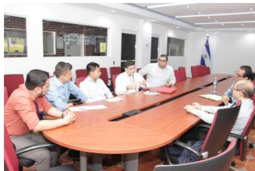
Figure 25: Meeting with authorities of UGB.

During the EMALCA, it was performed with the authorities of the Gerardo Barrios University. In the opportunity was explored possibilities of activities for continuing activities for strengthening mathematics in the region. It has been very well received and a proposal is expected to be elaborated.