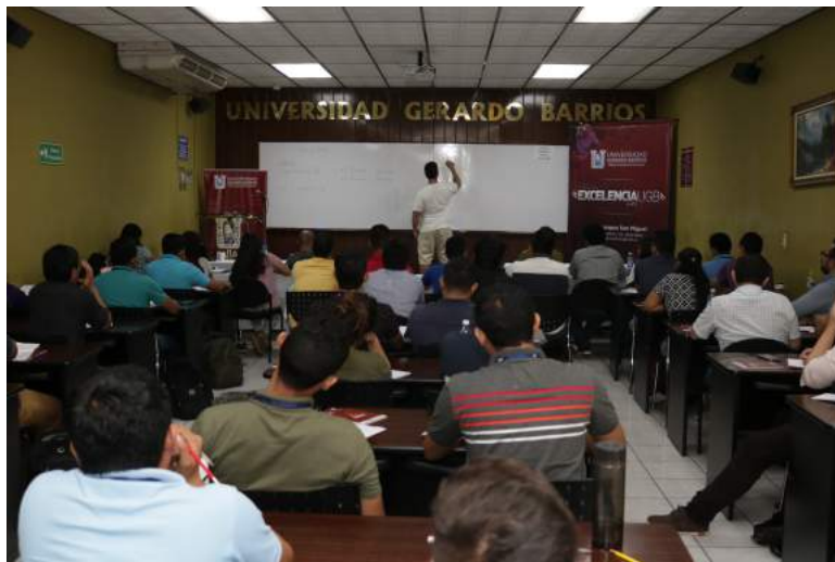
Figure 9: View of the course