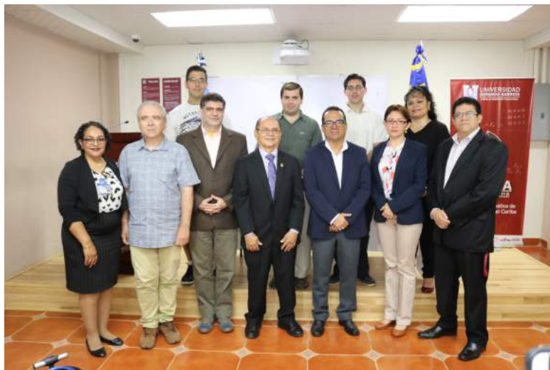
Figure 2: Authorities, professors and lecturers.