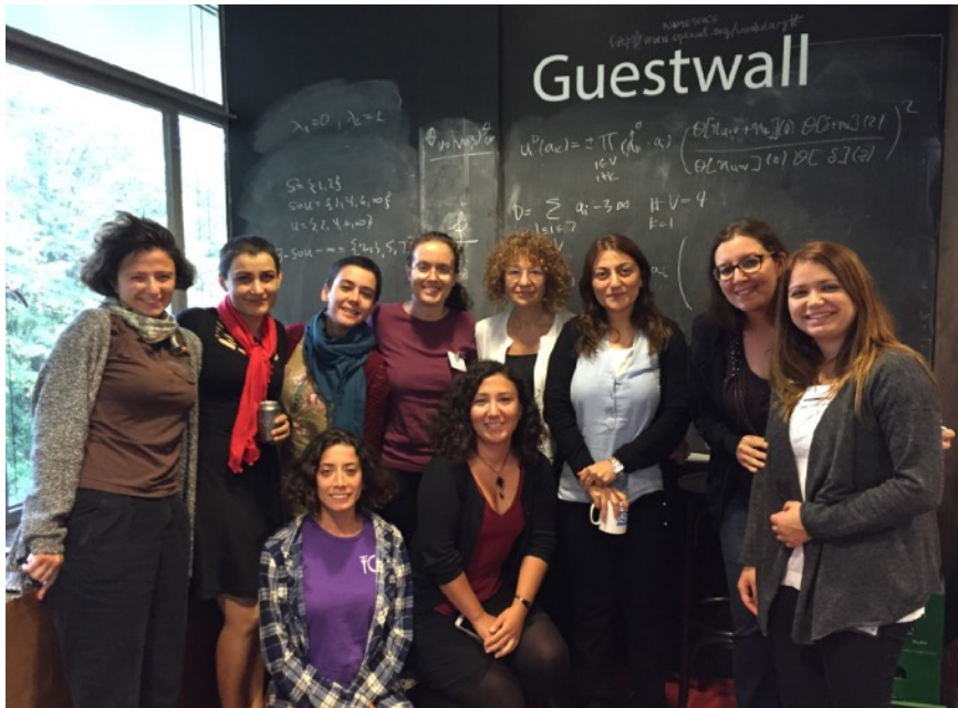
Women in Numbers Europe-2, Lorentz Center, together with participants from Turkey

sixth workshop in North America will take place. These workshops are quite different than regular conferences where the majority of the program is devoted to talks. In WIN-(E) workshops, the time is devoted to group work and discussions. These groups are formed months before the workshop, lead by senior mathematicians. The group leaders suggest a problem and background reading to the group members who are mostly advanced PhD students, postdocs or junior faculty. Everyone gets involved, is prepared and the group