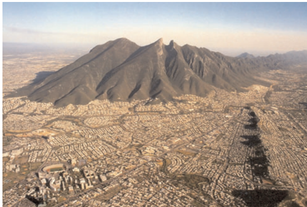
The city of Monterrey

Buses have extended service Schedule. There are also air-conditioned buses for short trips to nearby towns.