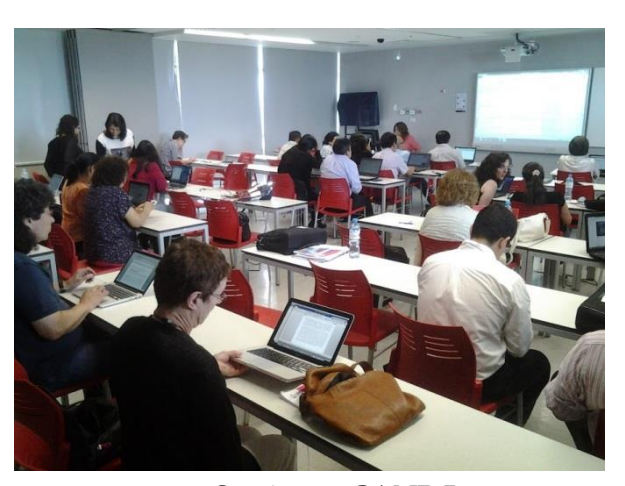
Session at CANP 5

This influenced the name CEMAS chosen for the network, and indeed CEMAS expects other countries of South America to join so that together they may build a solid network. The CANP5 has received important support from the Institutions of participant countries and CIAEM, but most significantly from the PUCP and the Ministry of Education of Perú that honored the program by sending high-level representatives to the inauguration and closing ceremonies.