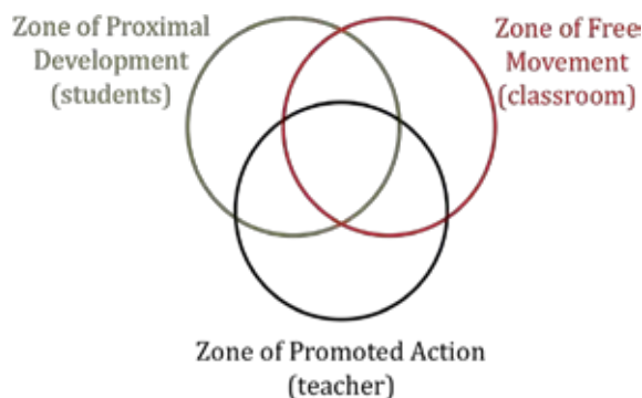
Figure 1. A possible zone configuration (teacher-as-teacher)

This teacher-as-teacher version of zone theory is useful for explaining apparent contradictions between the types of learning that teachers claim to promote and the learning environment they actually allow students to experience.