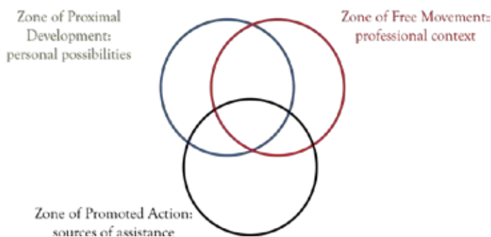
Figure 3. Adam's zone configuration for first year of teaching

The next year Adam was transferred to a different school that had fewer resources and a more difficult teaching environment. For example, there was only one class set of graphics calculators in the whole school, and most students were from low socio-economic backgrounds and could not afford to buy their own calculators. The learning environment was disruptive and poorly managed, and teachers felt frustrated at a perceived lack of support from the school's