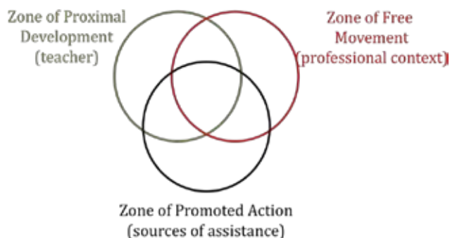
Figure 2. A possible zone configuration (teacher-as-learner)

cifically promoted by pre-service teacher education, formal professional development activities, or informal interaction with colleagues in the school setting. For learning to occur, the ZPA must engage with the individual's possibilities for development (ZPD) and must promote actions that the individual believes to be feasible within a given ZFM. It is significant that prospective teachers develop under the influence of two ZPAs, one provided by the university program and the other by the supervising teacher(s) in the practicum school, which do not necessarily coincide. A possible zone configuration for teacher-as-learner is represented in Figure 2.