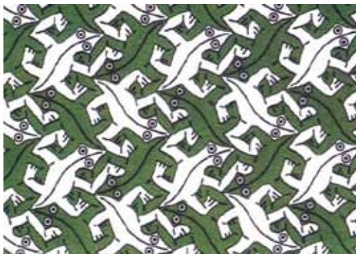
(M. C. Escher, 1965)

The Visual Education teacher wants to amplify the picture below but she put the following condition: the area of the amplified picture must be 400 times larger than this. The teacher is going to do a overhead transparency with the picture and project it in the wall. But she has a big problem: At what distance she must put the overhead projector from the wall? How can we help her? Write a report that includes the description of your investigations, the computations that you made, your conjectures and possible solutions.