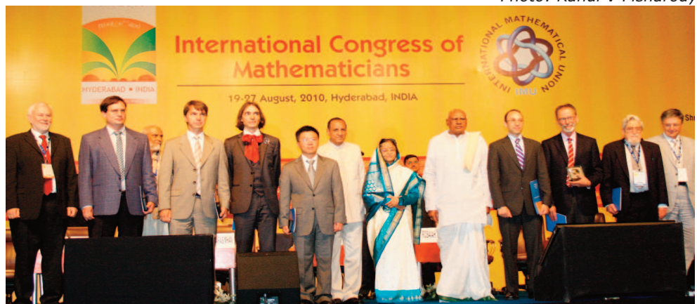
Proud Moment : President Pratibha Patil with the Fields Medalists after the Inauguration of ICM. Governor E.S. Narasimhan and Chief Minister K Rosaiah of AP are also seen.

Dr. K. Rosaiah cited a famous Telugu proverb meaning 'one who is good at calculations is a great man.' He said, 'The Congress will focus on the importance of mathematics as a discipline as well as a tool in Science and Technology and in many other practical matters'. He further added that ICM will focus public attention on mathematics.