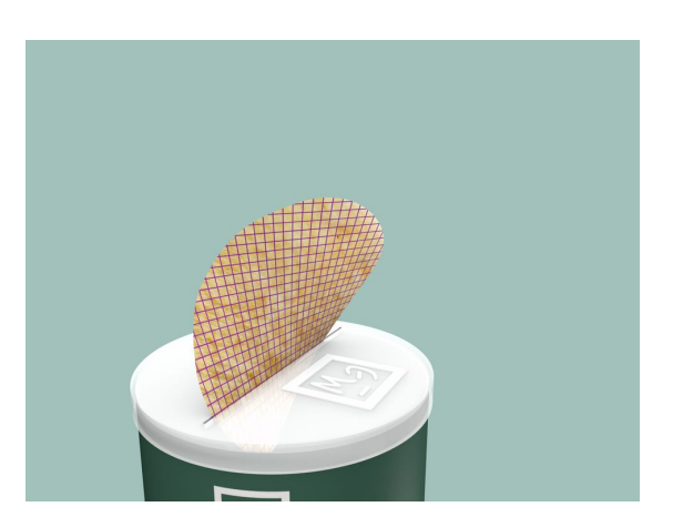
A hyperbolic paraboloid passes through a slit in the lid of a potato chip can.

If you cut a straight slit in the lid of a potato chip can, could you slide a chip through? You could if the chip belongs to the class of surfaces known as ruled surfaces, as shown in the animation "Chips as Hyperbolic Paraboloid". How can you create a perfect sine wave? In "Sine wave: cylinder net", a knife slices a sausage crosswise at an angle of 45 degrees, then slices the casing along the length of the sausage. The sausage disappears, leaving just the casing, which unrolls to reveal that one of its edges is now a sine wave. Viewers can use the animations as a basis to craft physical models of their own.